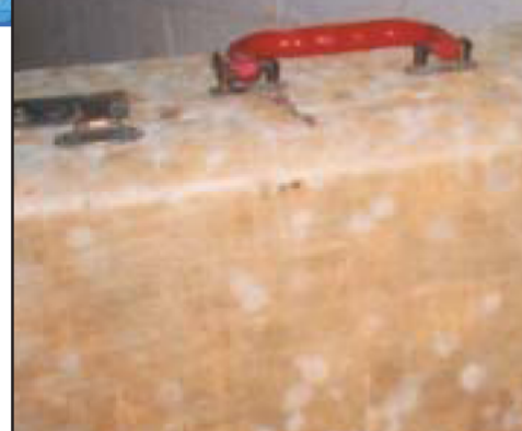
Mold growing on a suitcase stored in a humid basement.

It is important to take precautions to LIMIT YOUR EXPOSURE to mold and mold spores.