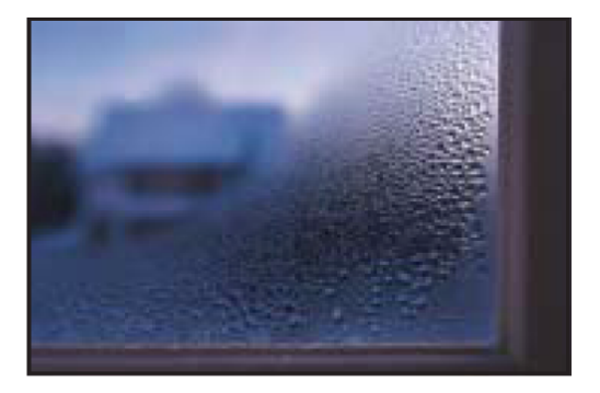
Condensation on the inside of a windowpane.

Keep indoor humidity low. If possible, keep indoor humidity below 60 percent (ideally between 30 and 50 percent) relative humidity. Relative humidity can be measured with a moisture or humidity meter, a small, inexpensive ($10-$50) instrument available at many hardware stores.