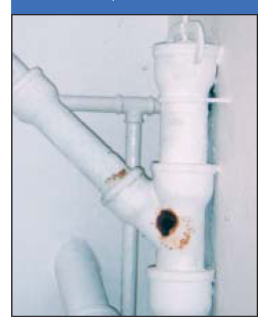
Rust is an indicator that condensation occurs on this drainpipe. The pipe should be insulated to prevent condensation.

Renters: Report all plumbing leaks and moisture problems immediately to your building owner, manager, or superintendent. In cases where persistent water problems are not addressed, you may want to contact