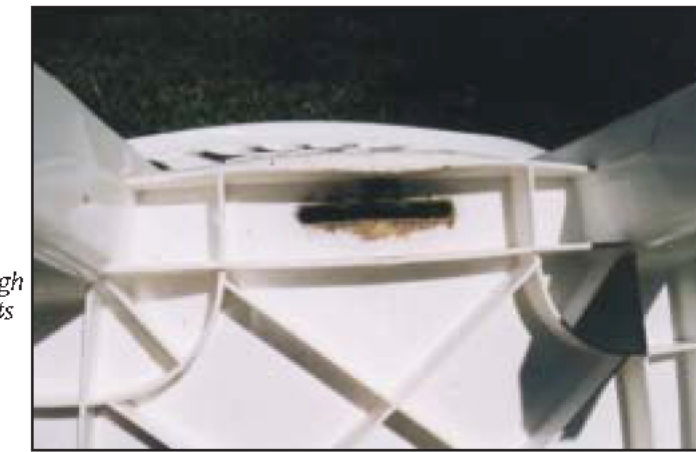
Mold growing on the underside of a plastic lawnchair in an area where rainwater drips through and deposits organic material.