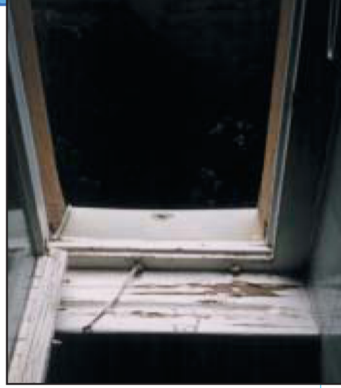
Leaky window – mold is beginning to rot the wooden frame and windowsill.

If you already have a mold problem – ACT QUICKLY. Mold damages what it grows on. The longer it grows, the more damage it can cause.